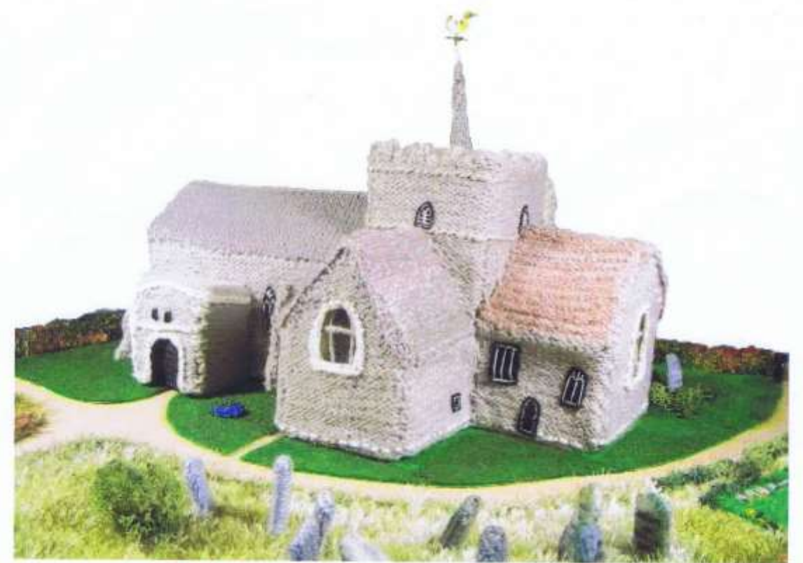
18th February - mid June

We are delighted to host the amazing Pirton knitted village. This wonderful community project will delight visitors young & old. Public opening: Tues 10am-4pm, Sat 10am-1pm, Sun 2-5pm