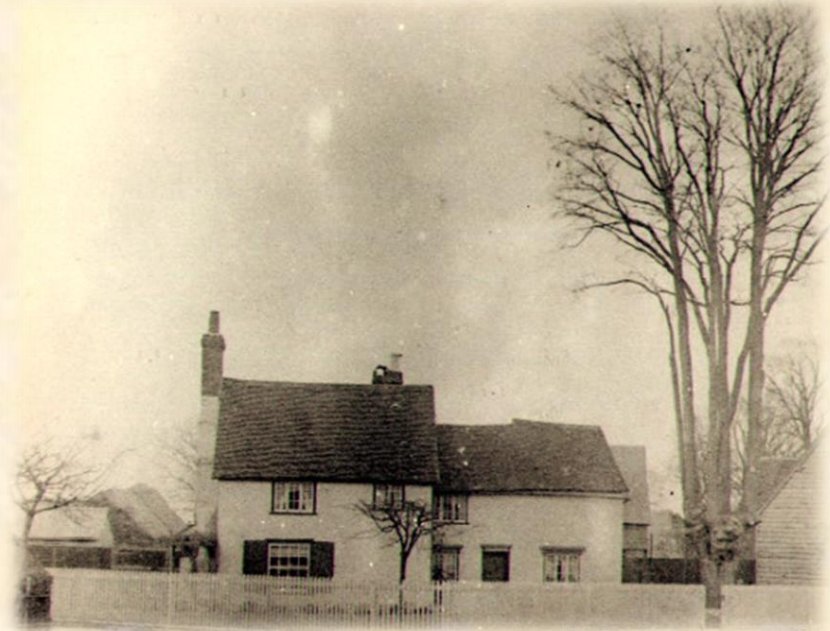
IMAGE RIGHT: ELMTREE COTTAGE: PASSED DOWN THROUGH COLLISON GENERATIONS FOR NEARLY 200 YEARS.