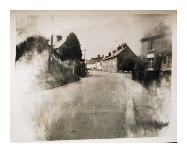
Figure 7: View down the High Street from 79

The view down the High Street shows Darkie Titmus' hardware store on the right (a veritable treasure trove for young eyes to wonder at) and the entrance to the newly constructed Cromwell Way London overspill estate with Cromwell Farm house visible on the right and with Milner's pork butchers building on the left.