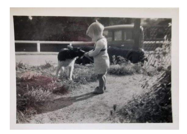
Figure 12 Blue Austin Seven in 1958 with Jip

Navigation was by stored knowledge of a route, the towns passed through and landmarks, mostly public houses, on the way. No sat navs then, but we didn't have to wait long before sitting down on 20 July 1969 to watch Neil Armstrong and Buzz Aldrin land on the moon with pinpoint precision thanks to support from NASA 240,000 miles away in Cape Canaveral.