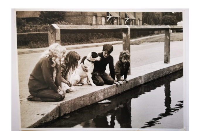
Figure 1: Patch in the papers by the Blacksmith's Pond

My Dad also impressed on us how fortunate we were to live on the same plot where the Blacksmith had his forge, as the ground all around the house was very dark, fertile soil, produced from the decades given over to receiving the spent ashes from the forge.