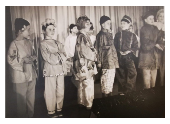
Figure 14: Aladdin production 1965 - Widow Twankey far right