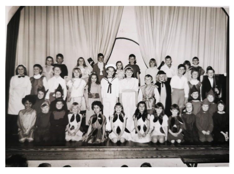
Figure 16 Cast of 'Singbad the Sailor' - Christmas 1967