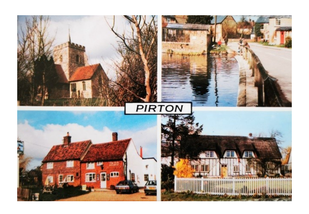
Figure 8: Pirton postcard of village sights