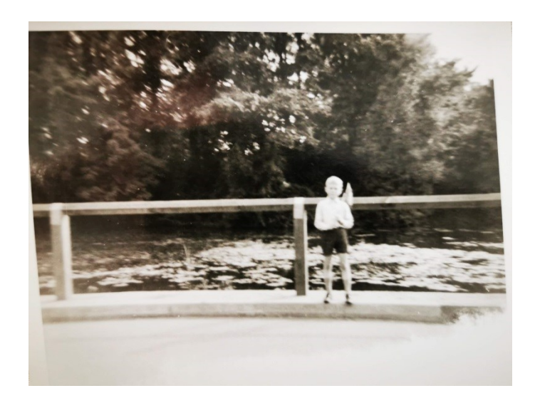
Figure 6: Armed with stocking nets to catch daphnia

same newts and possibly palmate newts too. The pond waters were sometimes coloured scarlet by huge amounts of daphnia swarms.