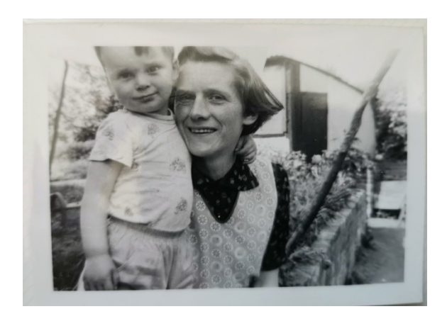
Figure 3: The height of the retaining wall shows the depth of ashes

Again around the back of the house, there are three steps that take you up to what used to be a raised back garden with pond and greengage tree behind. The ashes must have been piled very high.