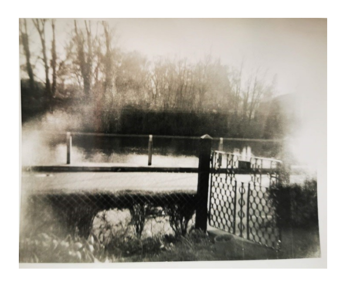
Figure 2: Mind the step down onto the High Street

Again around the back of the house, there are three steps that take you up to what used to be a raised back garden with pond and greengage tree behind. The ashes must have been piled very high.