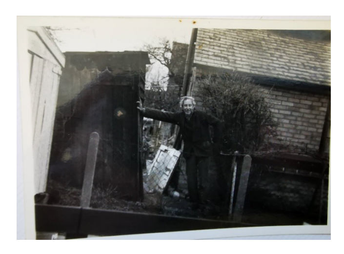
Figure 5: Harold and the lean-to WC

bathroom at the rear. Many houses still sported an outside loo. Ours, though decommissioned before my time, still stood for many years after its replacement, harbouring assorted older disused garden implements until its demolition many years after I left the village. It was always referred to as a feature and was the butt of many jokes during family visits.