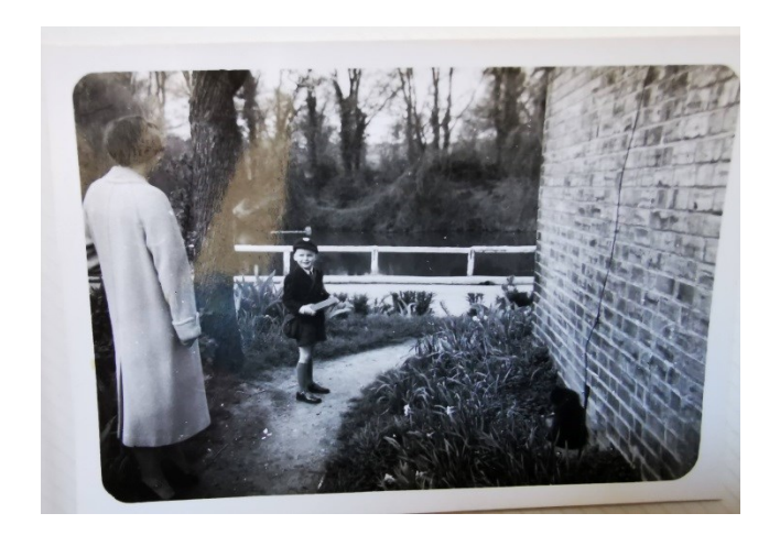
Figure 4: Lightning conductor to ground and one of many pear trees on the left – first day at school, 1964

Another impact from the outside is that the whole house stands proud of the nearby rooftops by that same foot or more. So much so, that the house had been struck by lightning on one occasion (before my time) making a crack down the length of the wall behind the fireplace, where the hastily installed lightning conductor now drops to the earth.