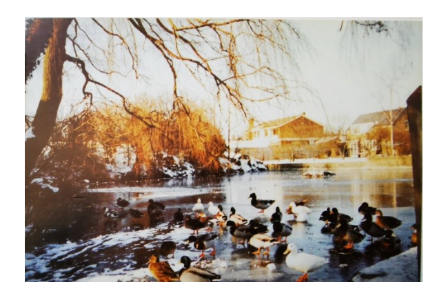
Figure 9: Blacksmith's Pond frozen over