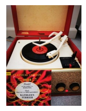
Figure 11 Dansette record player with 1946 recording of What is Life?

Music entered these same walls through the purchase of a Dansette record player (nothing was to be bought on the 'never-never' insisted on by both parents, known later as hire purchase) and to celebrate its arrival the first album bought with it was 'With the Beatles'.